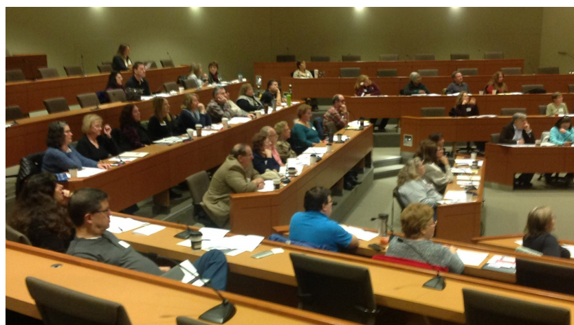
Above: Participants at the 2016 Pre-Retirement Seminar

On Saturday, November 4, Retiree Council 10 and Election District 10 will hold a Pre-Retirement Seminar at NYSUT Headquarters for active teachers and SRPs who belong to the Teachers' Retirement System. Those who are considering retiring in the next few years as well as those in Tiers V and VI will receive information about their retirement benefits from each of those tiers.