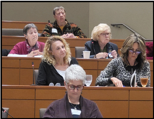
Participants at the 2024 Fall Luncheon