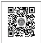
RC 10 April 23 Conference