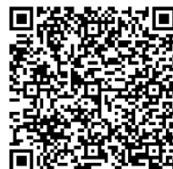
RC 10 Candidates